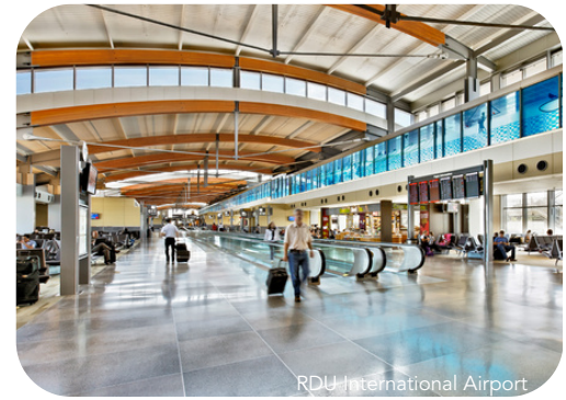
RDU International Airport