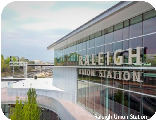
Raleigh Union Station