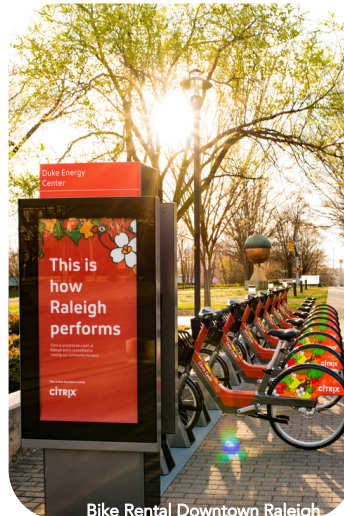
Bike Rental Downtown Raleigh