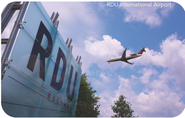
RDU International Airport